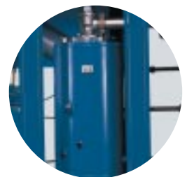
Large reclaimers with generously-sized fine separator elements, large oil coolers and aftercoolers