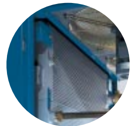
The large aftercooler effectively cools compressed air and is easily accessible for maintenance