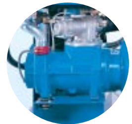
The high capacity compression element, with low rotor-tip speeds, gives high efficiency with maximum reliability