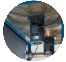
Package cooling fan. The cool air passing through the unit picks up all radiant heat

As an option a heat recovery system can be incorporated into the oil circuit.