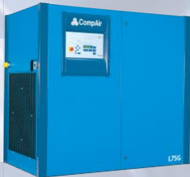
The ComPAir L Series. A high capacity air compressor range that sets the highest standards in reliable, economical and efficient operation.