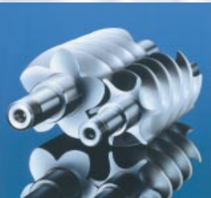
The ComPAir screw profile - the result of continuous research and development